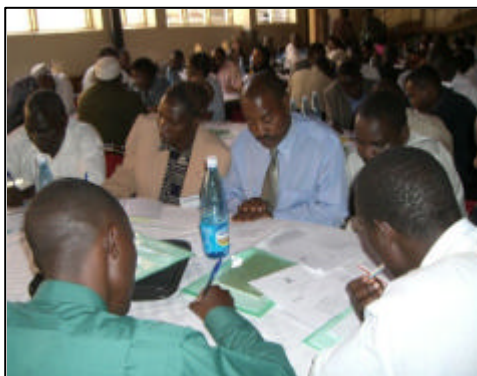
Stakeholders' meeting in Embu

From 4 to 18 October 2006, the APHIA team visited seven districts in Eastern province: Mbeere, Meru North, Meru South, Isiolo, Tharaka, Embu and Meru Central. The purpose of these visits was to review annual operational work plans and identify priority gaps that APHIA II can address in the coming years.