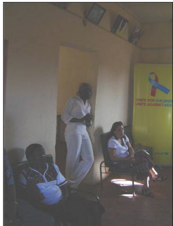
APHIA II Staff in Eastern Province with Pepo La Tumaini Isiolo