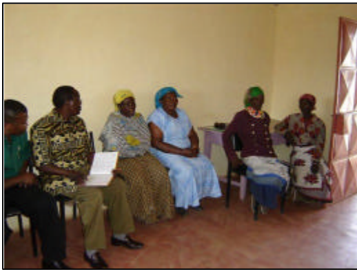
APHIA II Team Leaders in Isiolo

PATH: PATH creates sustainable solutions to break longstanding cycles of poor health. A major component of the APHIA II Eastern Program is reaching out to groups in Eastern province to effect behaviour change. PATH will mobilize communities to reduce stigma and increase the use of services.