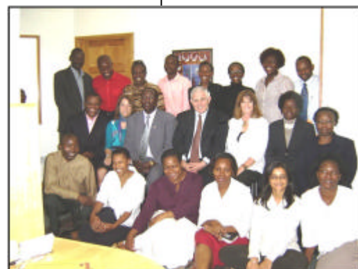
APHIA II Eastern Team with colleagues from other JHPIEGO programmes in Nairobi