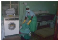
Baseline Assessment of Facilities—Linen Processing