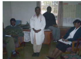
Feedback on assessment exercise is very critical in determining the acceptance or rejection of the findings