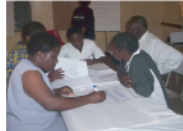
Training Service Providers in Injection Safety, IP and PQI using SBM-R