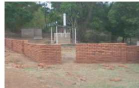
Some improvements involved construction of infrastructure such as basic incinerator for burning medical wastes